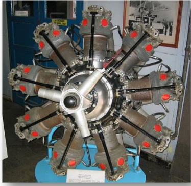
The Bristol Pegasus XXII Engine