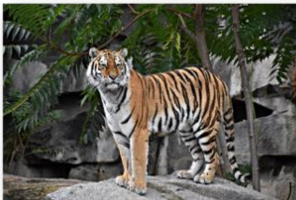
The Tiger is a Wild Cat