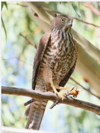
The Goshawk is a bird of prey